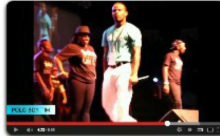
Teen Summit 2012 Performance Video