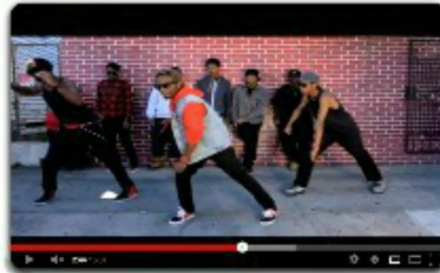
That Ninja Cold Music Video