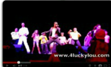
Back 2 School Performance Video