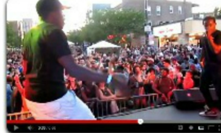
Chicago Division Fest Performance Video