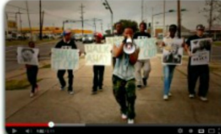
Stomp The Violence Music Video